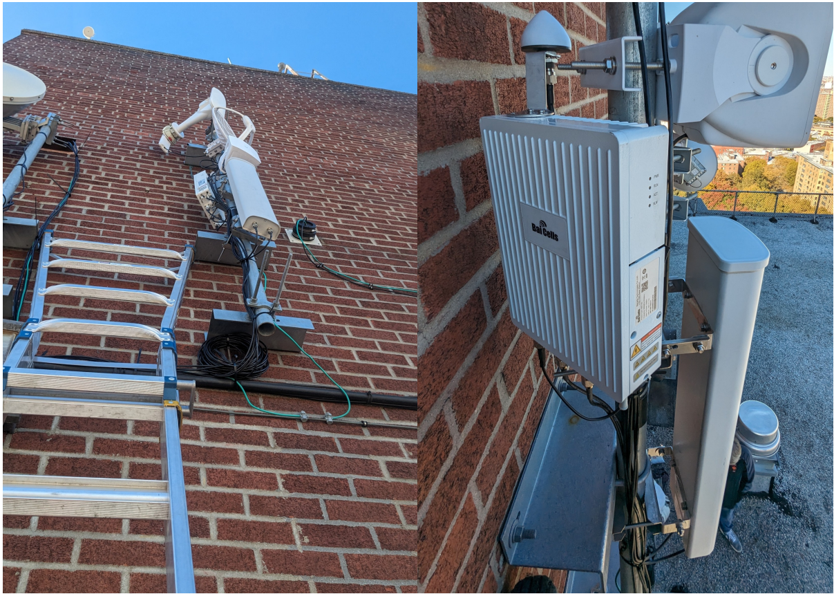
The Nova 233 and AW-3014-T4 installed on the East Mast of Vernon.